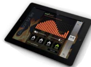
Ved sett H1